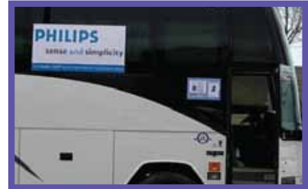
4'w x 2'h Bus Window Sign