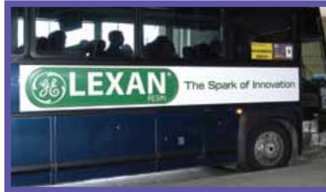
15'w x 2'h Bus Sign