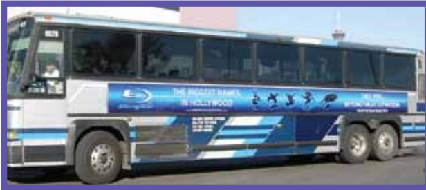
30'w x 2'h Bus Sign