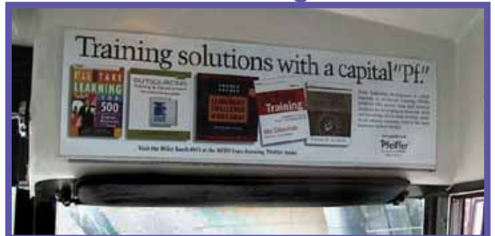
40'w x 12'h Bus Sign facing passengers

FOR INFORMATION: Call Bob Kaplan at 866-210-8489 or email bobk@cmac.net