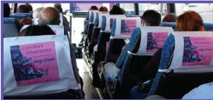
20 per bus on aisle seats of Deluxe Coaches