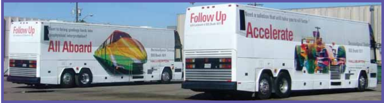
Full Bus Wrap on Deluxe Coach